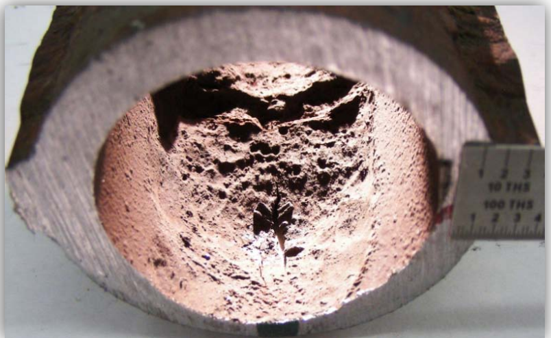
Examples of Under-Deposit Corrosion